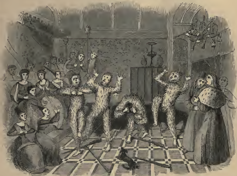
THE MASQUE AT PARIS, in which the King and others were in great danger. From a MS. of the 15th century

the torches from his servants, and, holding it too near their dresses, set them on fire. Flax, you know, is instantly in a blaze, and the pitch, with which the cloth had been covered to fasten the flax, added to the impossibility of extinguishing it. They were likewise chained together, and their cries were dreadful; for, the fire was so strong, scarcely any dared approach. Some knights indeed did their utmost to disengage them, but the pitch burnt their hands very severely; and they suffered a long time afterwards from it.